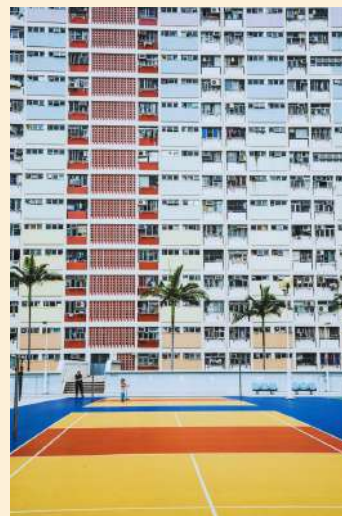
Choi Hung "Rainbow" Estate