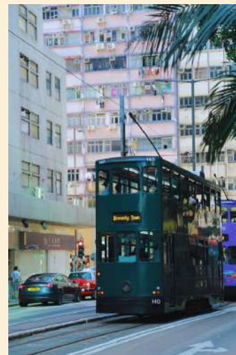
Kennedy Town Tram Terminus