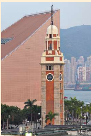
Clock Tower in Tsim Sha Tsui