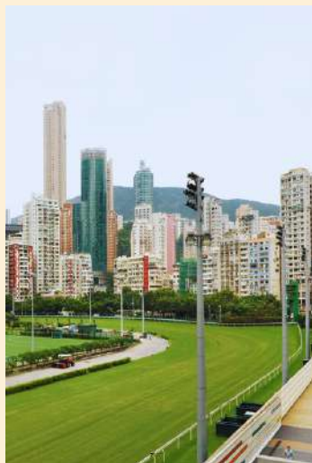
Happy Valley Racecourse